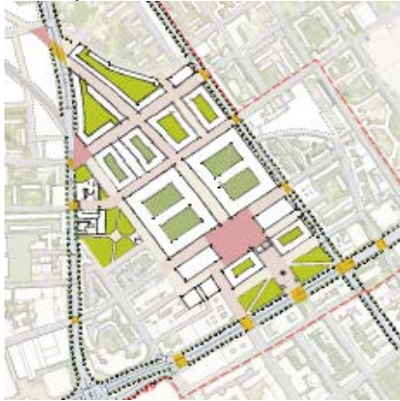
Option 4a: maximised decking/ OSD masterplan (lowered station platforms and tracks)