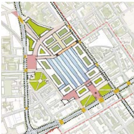
Option 4c: HS2 Option 8 - EAP response