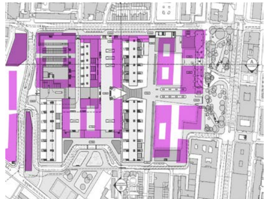
Option 4b: HS2 Option B1 EAP initial response masterplan