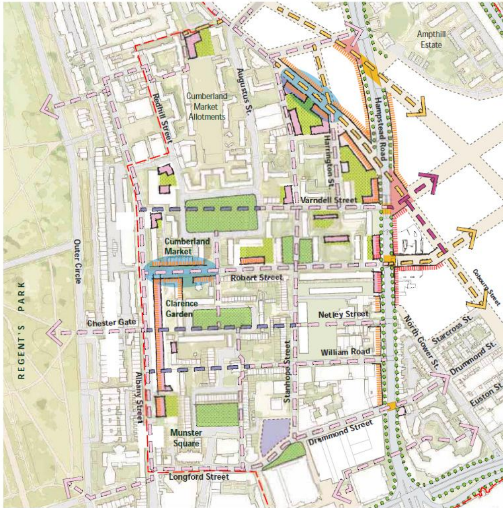
Figure 4.8 Regents Park Estate illustrative masterplan